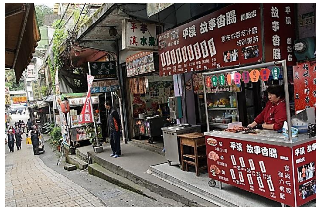
Pingxi Old Street