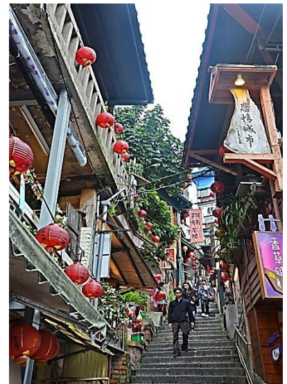
Jiufen Old Street

Our journey will continue as we visit an extremely popular tourist destination in Taiwan, the Jiufen Old Street. There's a wide array of folk arts, crafts stalls, traditional grocery stores, bed & breakfast inns, and tea houses that are sure to induce nostalgic sentiments. Amongst the many activities here, you can sample a variety of traditional Taiwanese snack foods such as taro balls, meatballs, Mochi, and more!