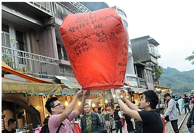
Sky Lantern Release

In the afternoon, we will head to the original coal distribution center – Pingxi, an important hub for coal-producing areas in the 1970's. Pingxi old street is built into a hill with train tracks penetrating through the center. Various shops are dispersed along the tracks, selling local food and gift items. This is also the only place in Taiwan where it's legal to release sky lanterns, a symbolic gesture of writing down your prayers on a hot-air balloon and sending into the sky from the railroad tracks.